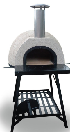
JA 60 & JA 70 Dome with granite bench