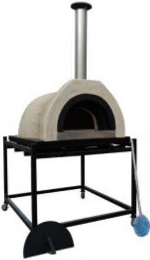
Jaland Classic with stand (wheels included)