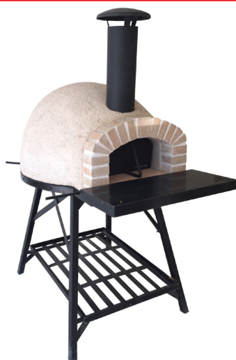
JA 70 (RB) Real Brick with (or without) granite bench