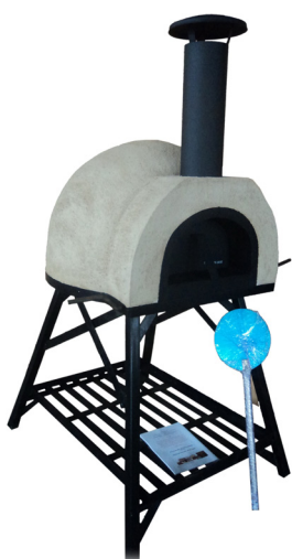
JA 60 & JA 70 Dome without granite bench