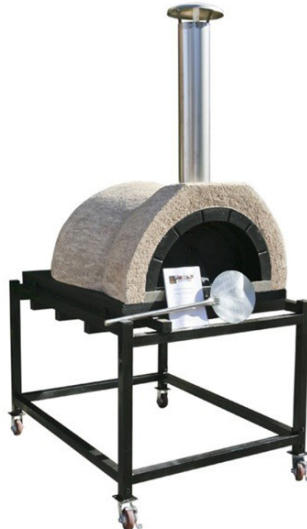
JA 90, JA 100 & JA 110 with stand (wheels included)