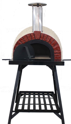
BA 60 & BA 70 Brick arch with (or without) granite Bench